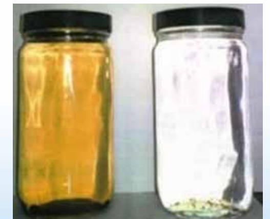
Before and after water samples treated with our OxyPlus™ System.